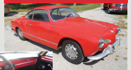
1967 Karmann Ghia