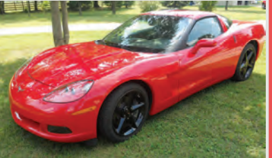
2013 Corvette LS3 60th Anniversary 7,100 miles, 1 owner Auto/4 speed