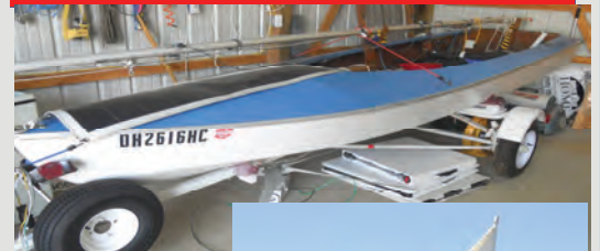
1967 Folbolt sailboat