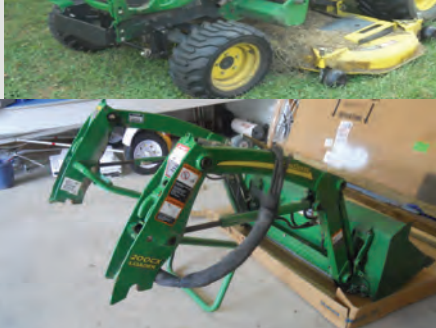
JD 647 tiller 4' pto drive