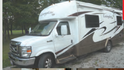
2009 Motor Home

HP DesignJet 1050C Plus plotter , color, 4 cartridge works great, architect plan storage file cabinet, steel storage cabinet